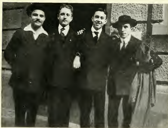
FOUR YOUNG BAHAI'S OF ESSLINGEN